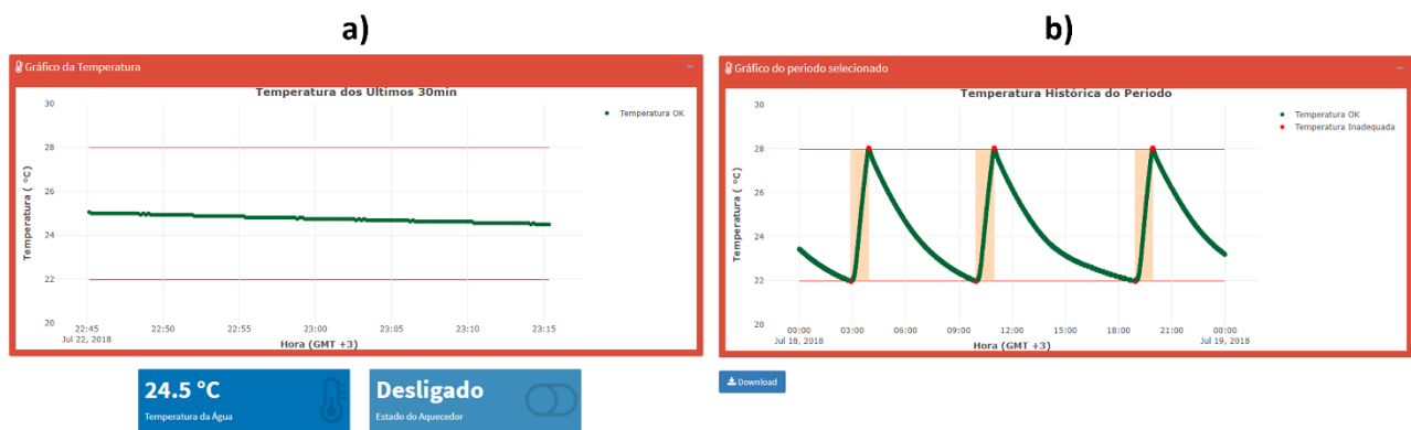
Figure 2. Views of the environment web application. a) dashboard view; b) timeline view.

Finally, the implementation documentation was produced describing the performed steps and the generated results. Figure 3 presents the development environment assembled with sensors and actuators, and the web application running the described dashboards.