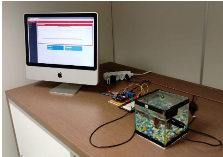
Figure 3. AcquaSmart development environment.